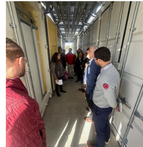
Photos from FBNA 2025 Technical Tour: 2MW/8MWh CellCube vanadium flow battery owned by G&W Electric near Chicago and operated for market revenues and facility resiliency.